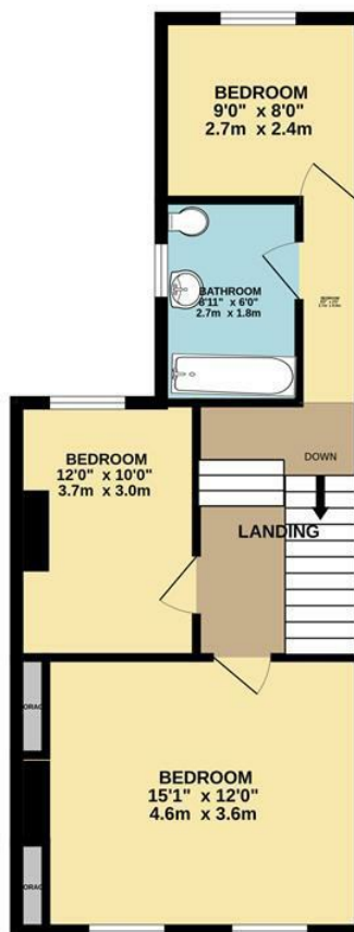
1ST FLOOR 488 sq.ft. (45.1 sq.m.) approx.